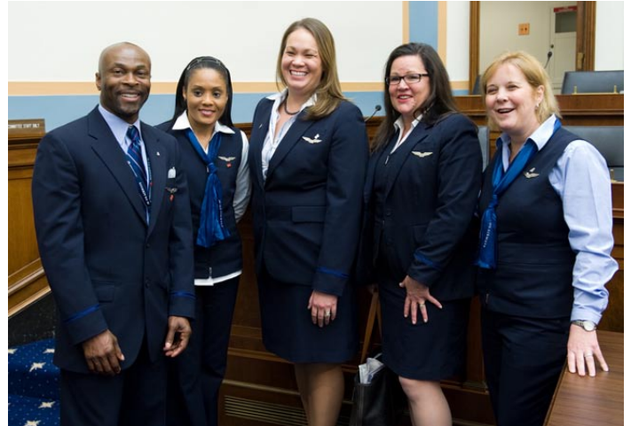
US Airways flight attendants following the hearing on Tuesday.

"Consumers will have three strong, healthy global network carriers from which to choose, as well as a number of low cost carriers... The new American will have the financial strength to invest the resources needed to improve the customer experience, including new aircraft, cutting edge products and services, and the technology and tools designed to help our employees deliver superior service to our customers."