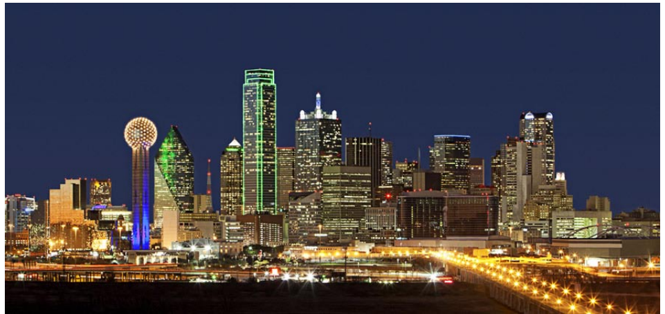
Above, the Dallas skyline.